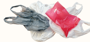
Plastic Bags Plastic Wrap