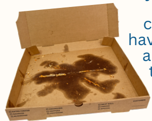
Cardboard with residue

Please do NOT include these items with your recycling. While they may be accepted in other communities, these items have low recyclability value and are difficult materials to market. We encourage residents to choose alternative packaging when possible.