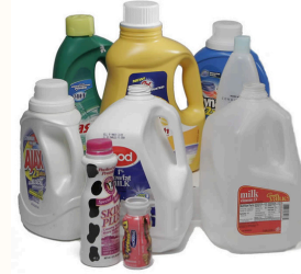
#2 Plastic Bottles (no lids)