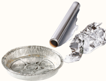
Aluminum Foil & Pie Plates