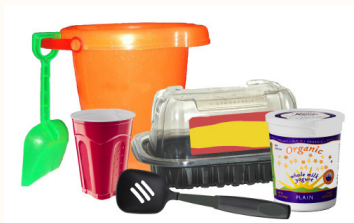
Number 3-7 Plastics