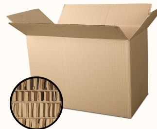
Corrugated Cardboard & Brown Paper