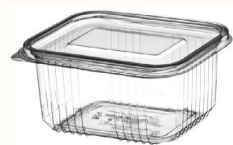
Plastic food containers, even if it indicates #1 or #2