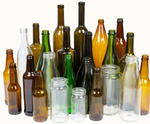
Glass Bottles/Jars All colors can be mixed