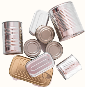
Steel Food Cans