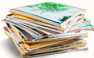
Magazines & Catalogs