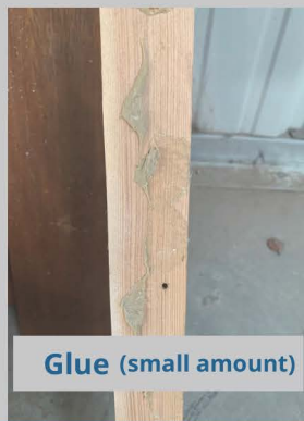
Glue (small amount)