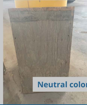
Neutral colored paint/stain/stamps