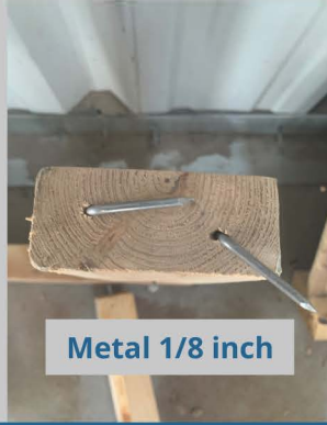
Metal 1/8 inch