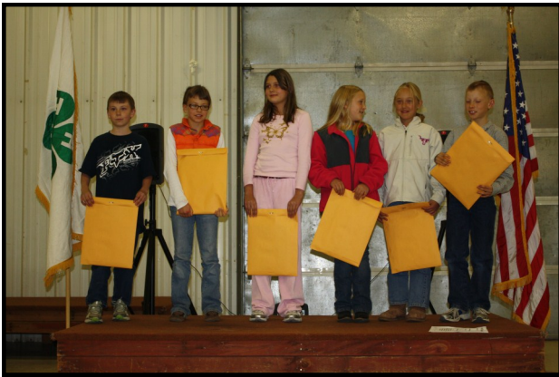
Congratulations to all the 1st Year 4-H Members!